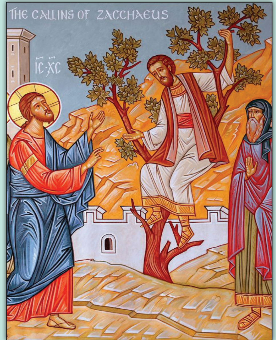
Icon of Christ and Zacchaeus (Luke 19:1-10)