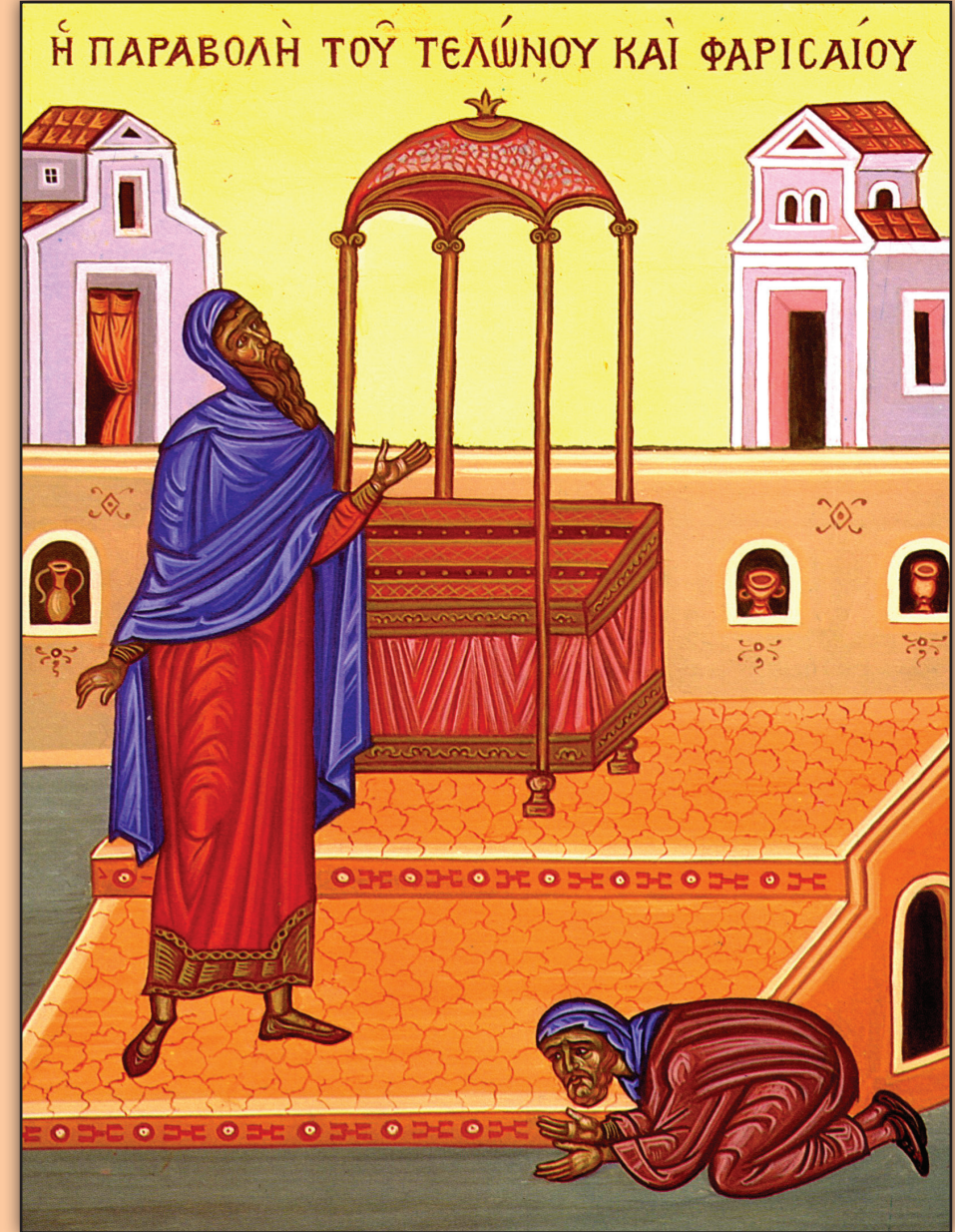
Icon of the Publican and Pharisee (Luke 18:10-14)