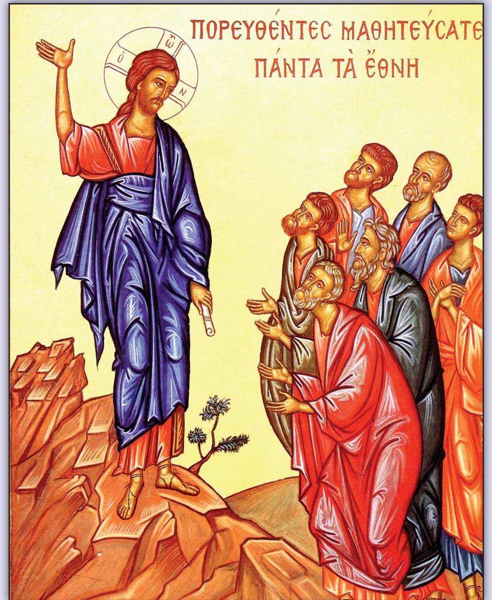
Icon of Christ Teaching the Apostles