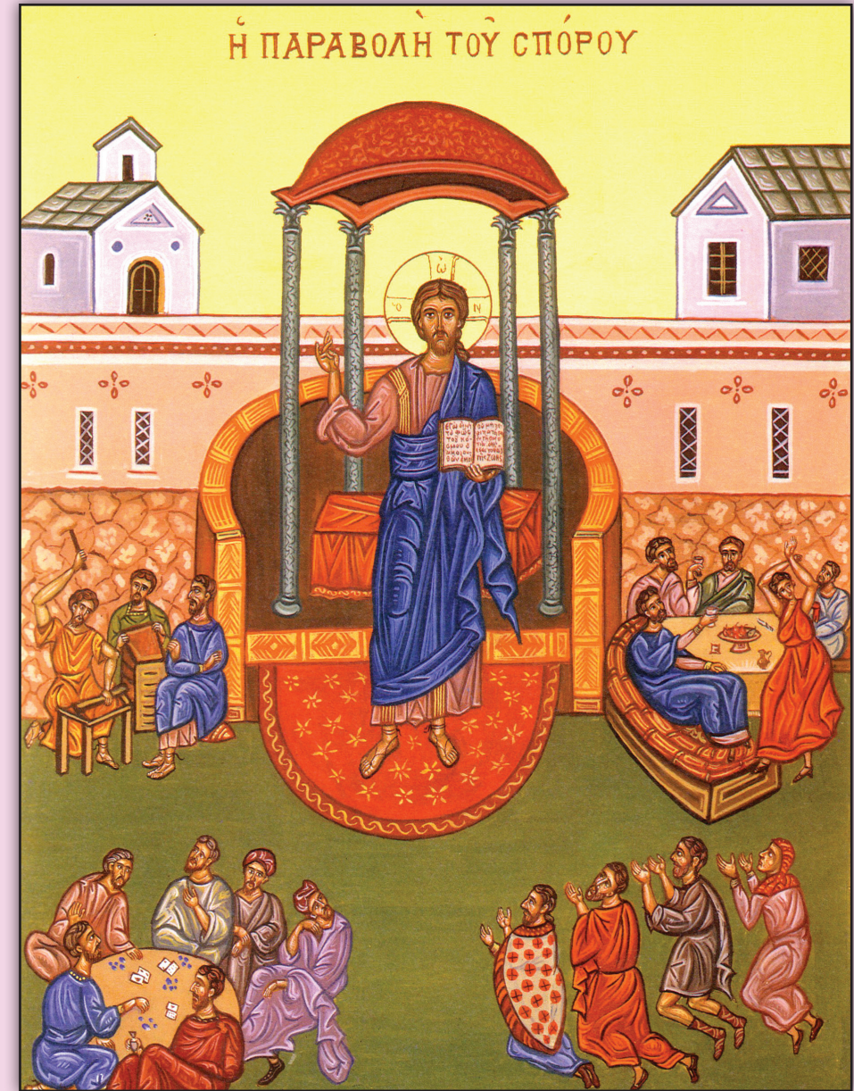
Icon of Parable of the Sower and Seed