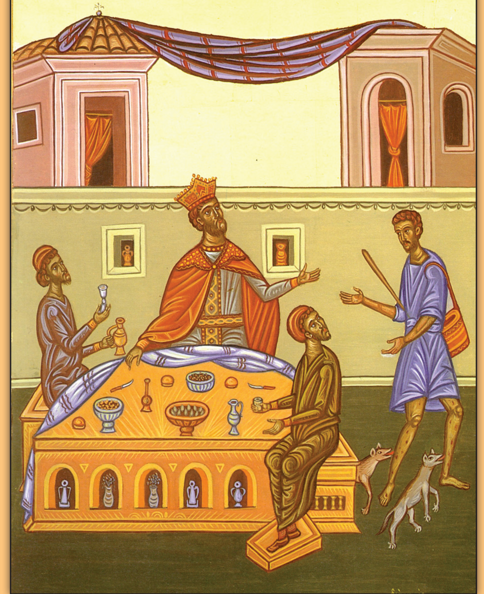
Icon of the Parable of the Rich Man and Lazarus

Ἡ ΠΑΡΑΒΟΛὴ τοῦ Πλουσίου καὶ τοῦ Πτωχοῦ Λαζάρου