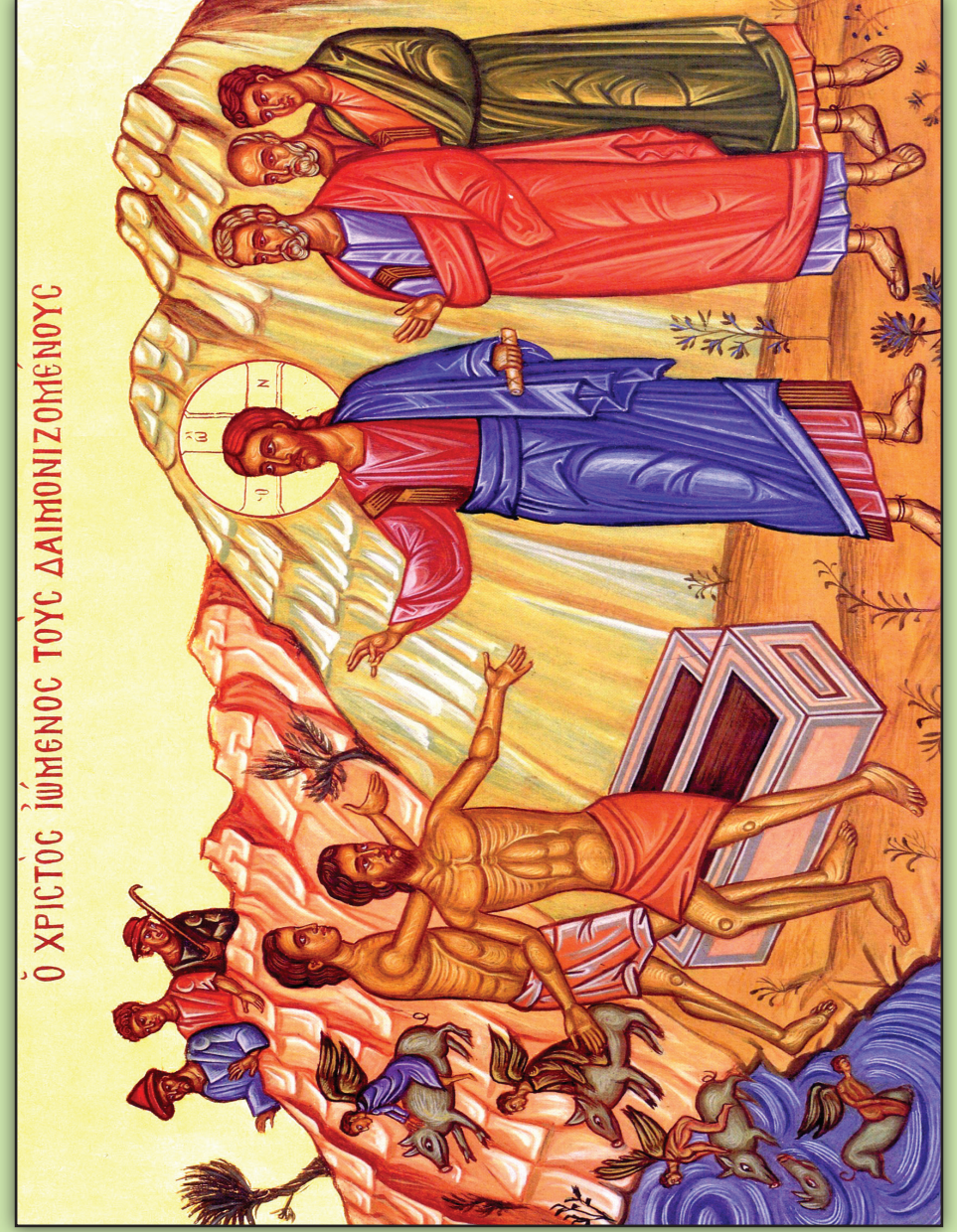
Icon of Healing the Gadarenes