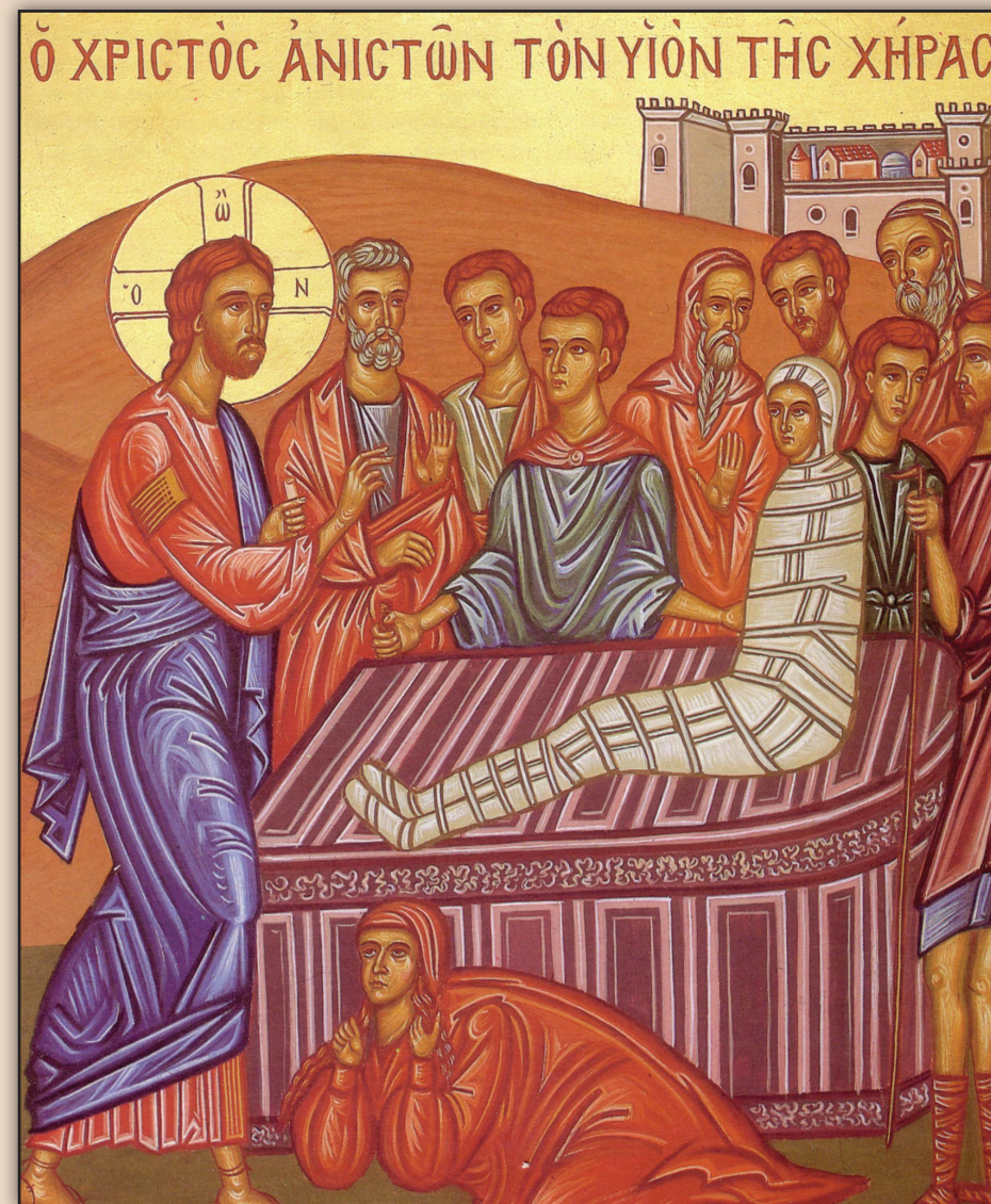
Icon of Christ Raising the Widow's Son