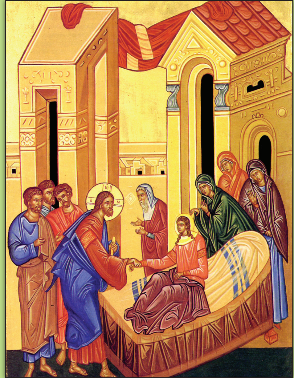
Icon of Healing Jairus' Daughter (Luke 8:41-56)