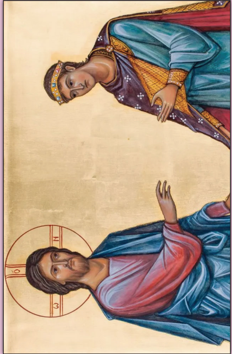
Icon of the Rich Ruler (Luke 18:18-27)