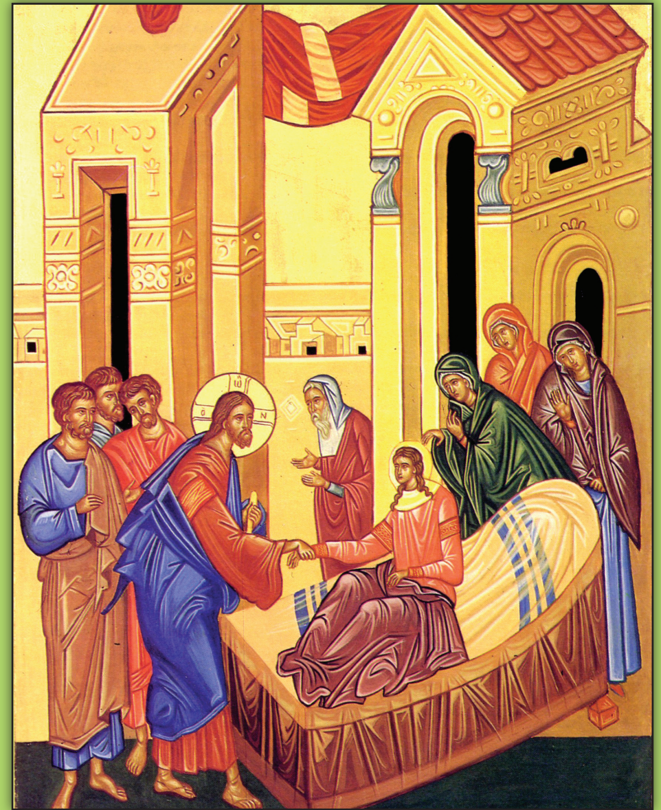
Icon of the Healing of Jarius' Daughter

Visit www.ecpubs.com for more publications.