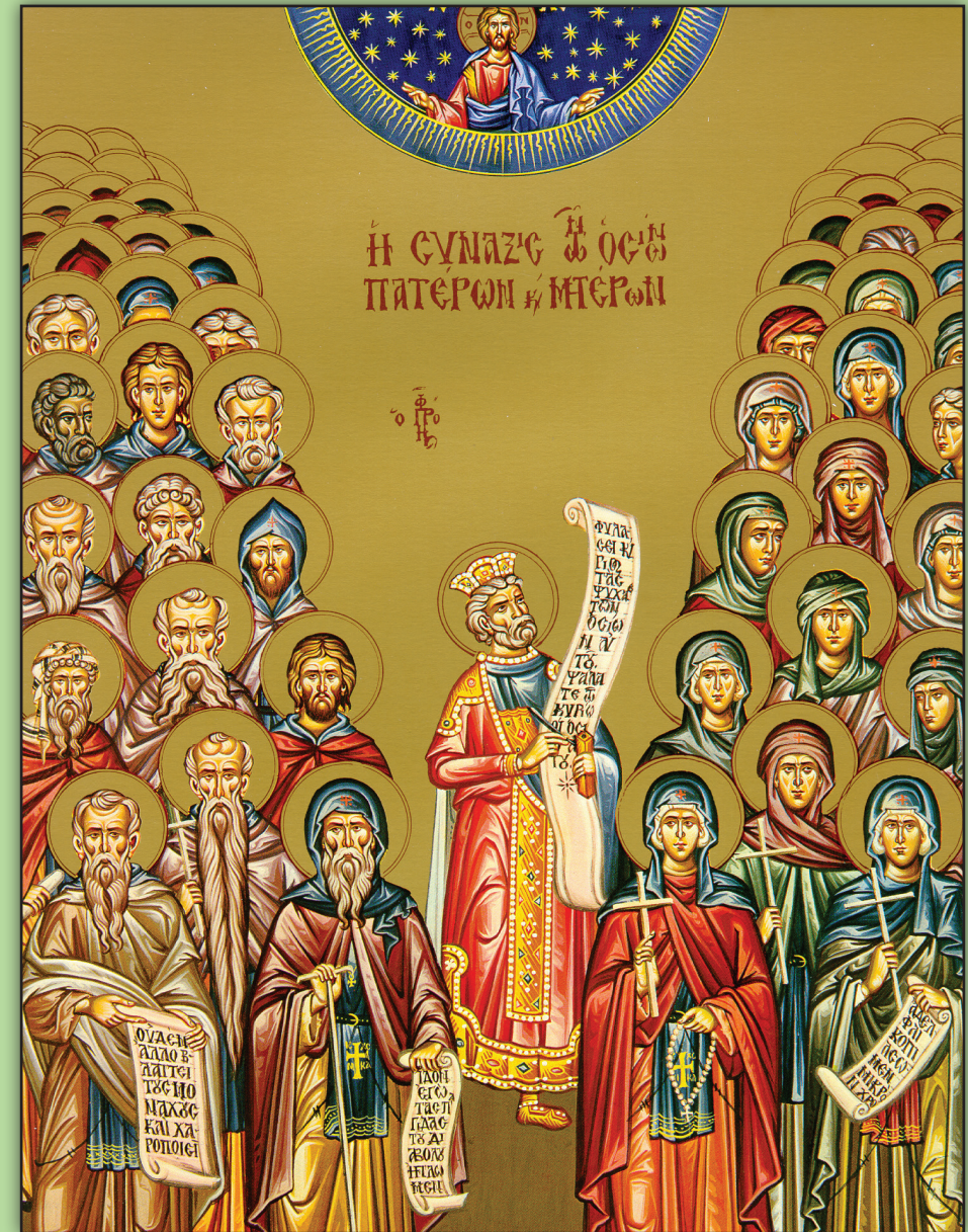
Icon of the Holy Ancestors