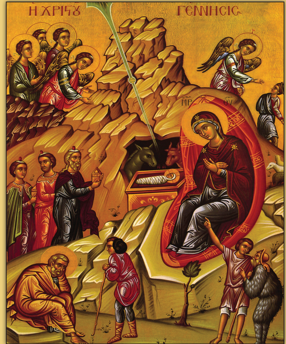
Icon of the Nativity of Our Lord -- December 25th