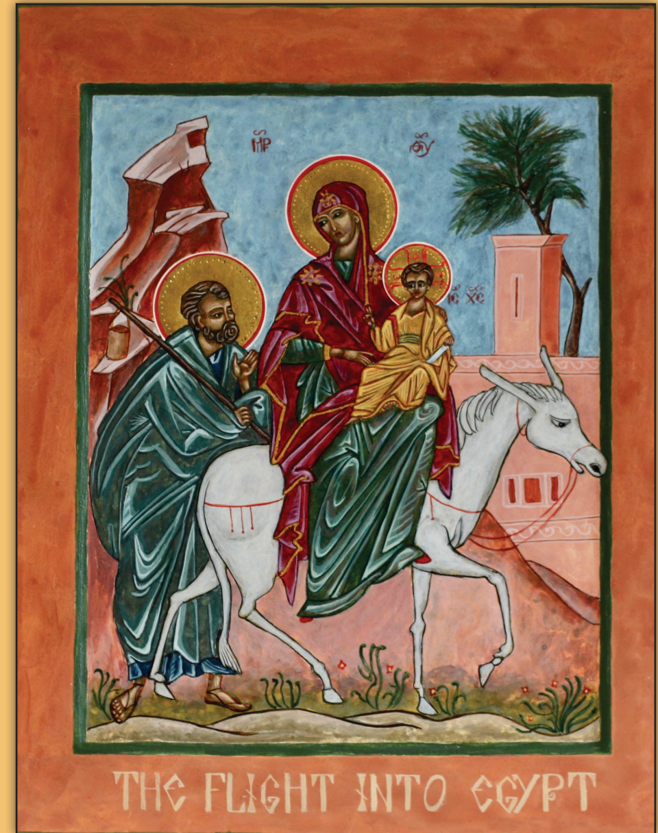
Icon of the Flight into Egypt -- Matthew 2:13-23