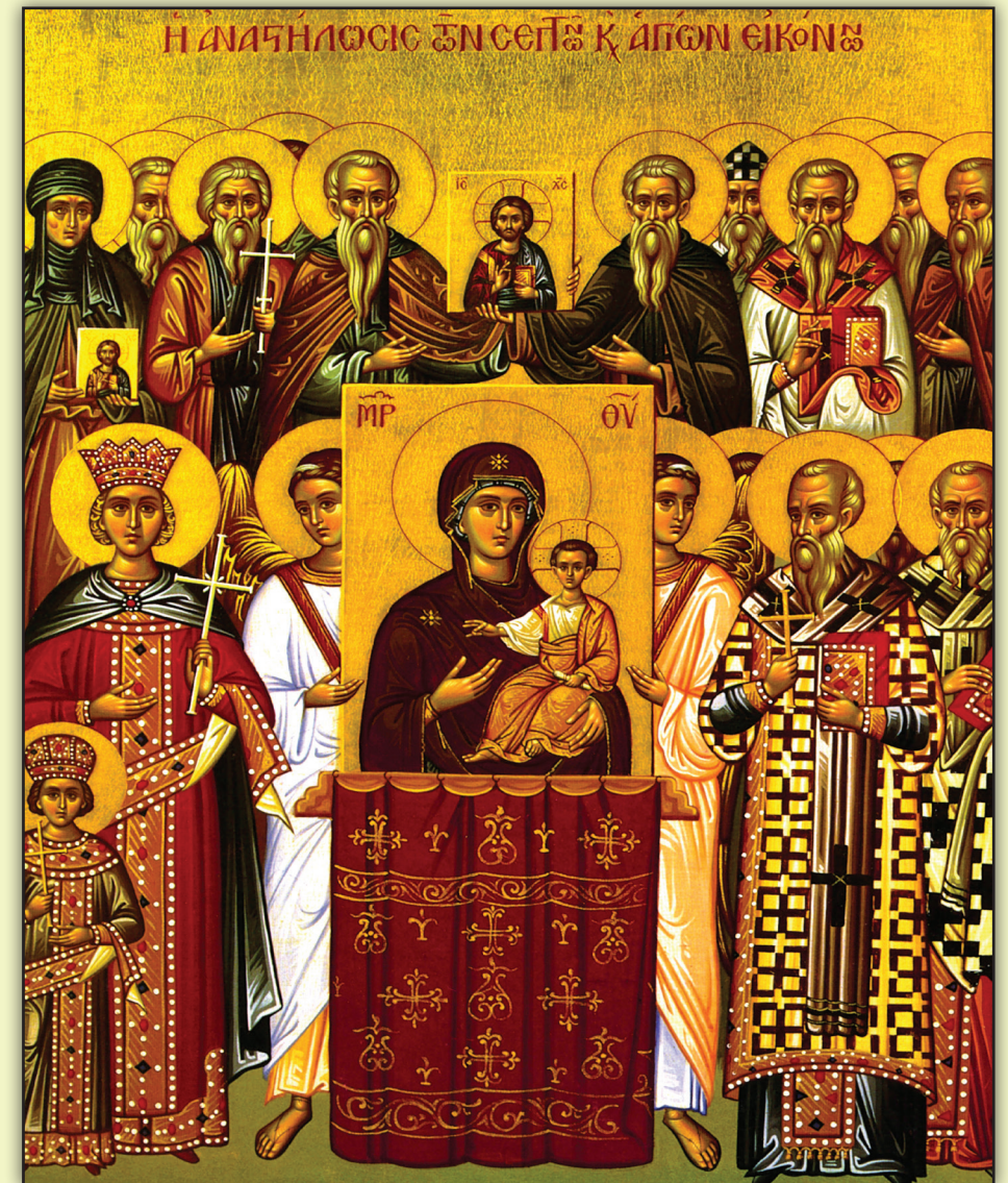
Icon of the Restoration of Holy Images