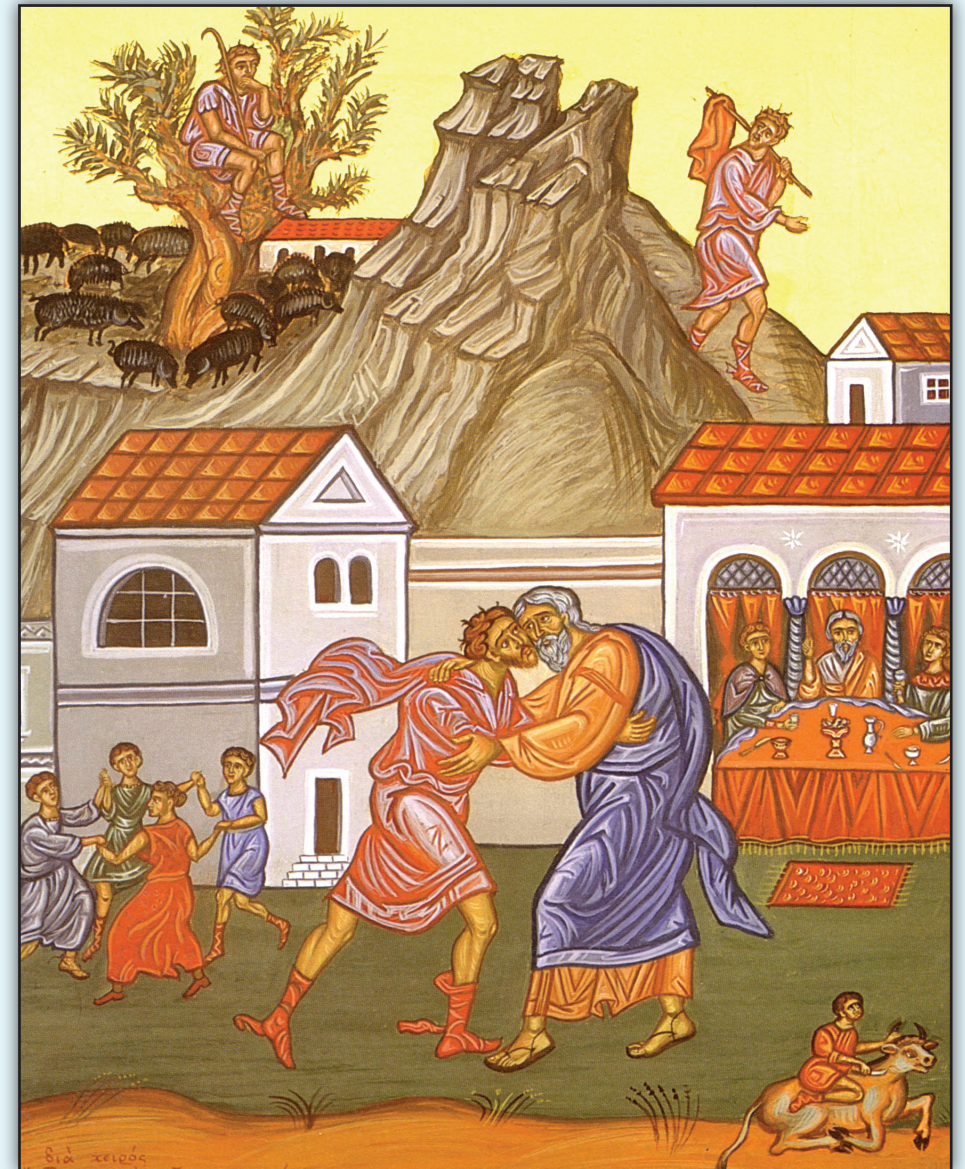
Icon of the Prodigal Son (Luke 15:11-32)