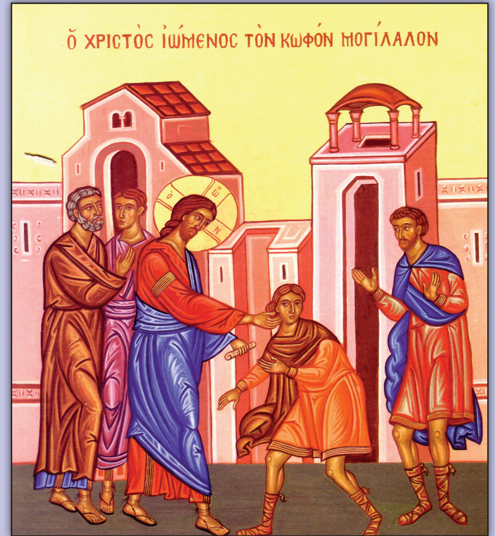
Icon of the Healing of the Deaf Mute -- Mark 9:17-31