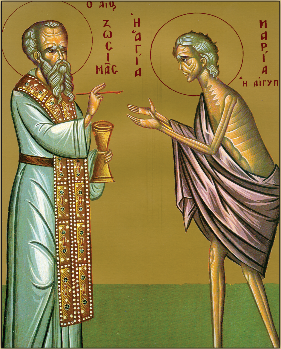
Icon of Saints Zozimos and Mary of Egypt