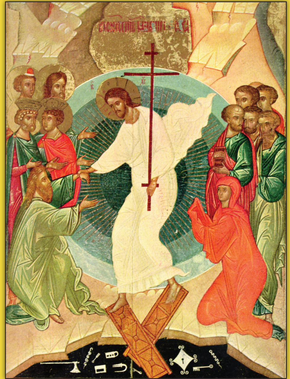
Icon of the Resurrection