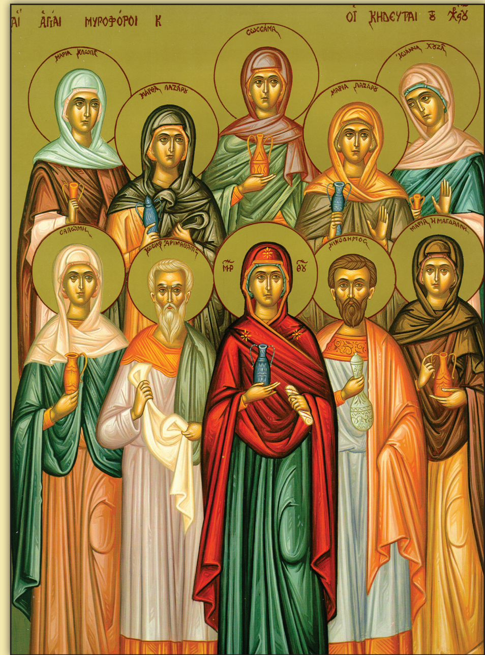
Icon of the Myrrh-bearing Women