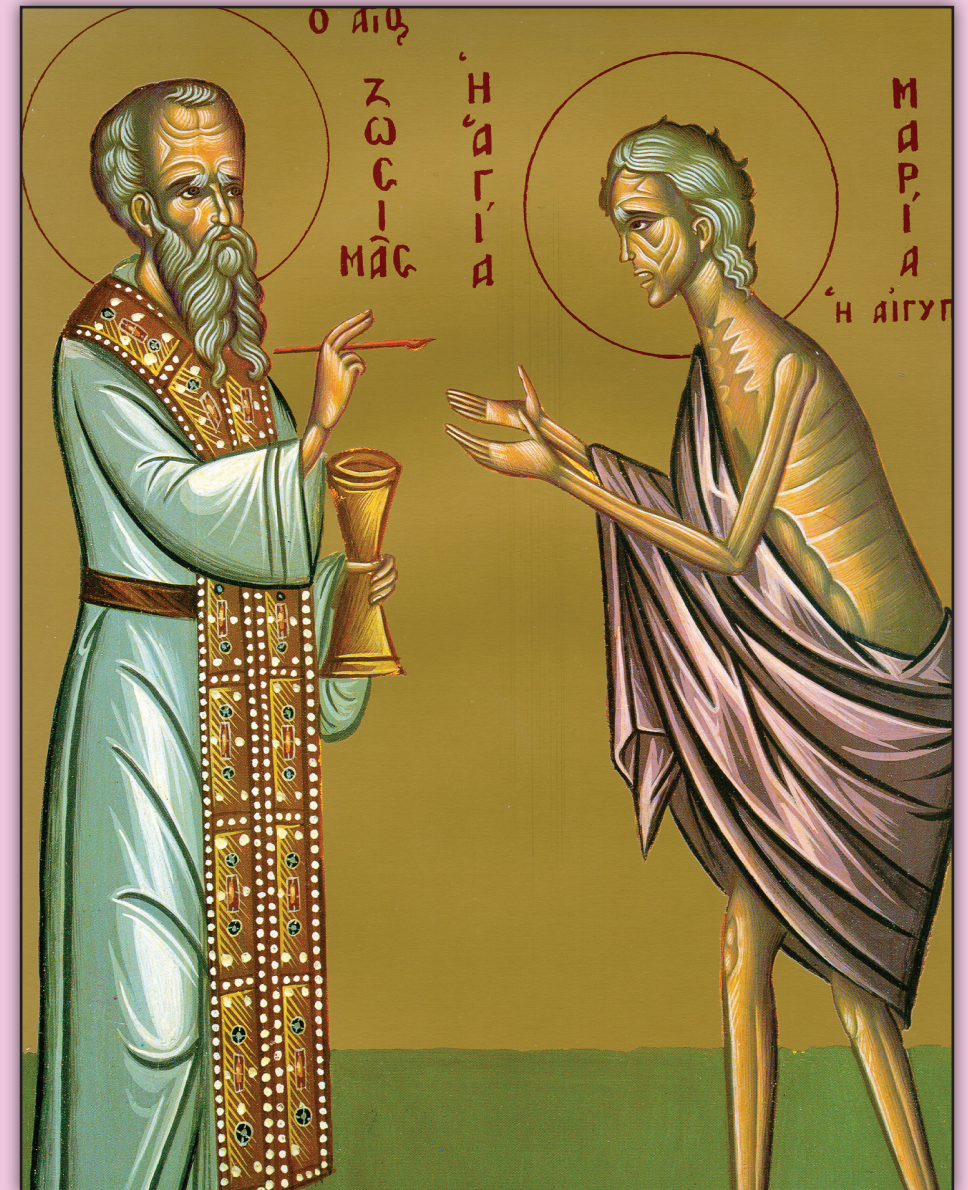
Icon of Saint Mary and Father Zozimos