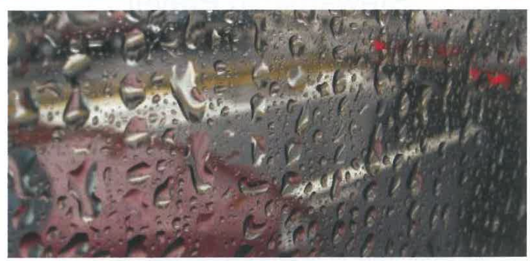
"The act of serving brought a ray of light to my once downcast and dreary day."