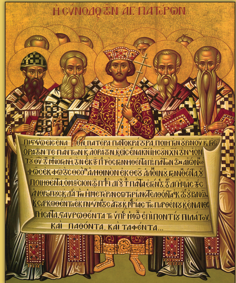
Icon of the Fathers of the First Ecumenical Council