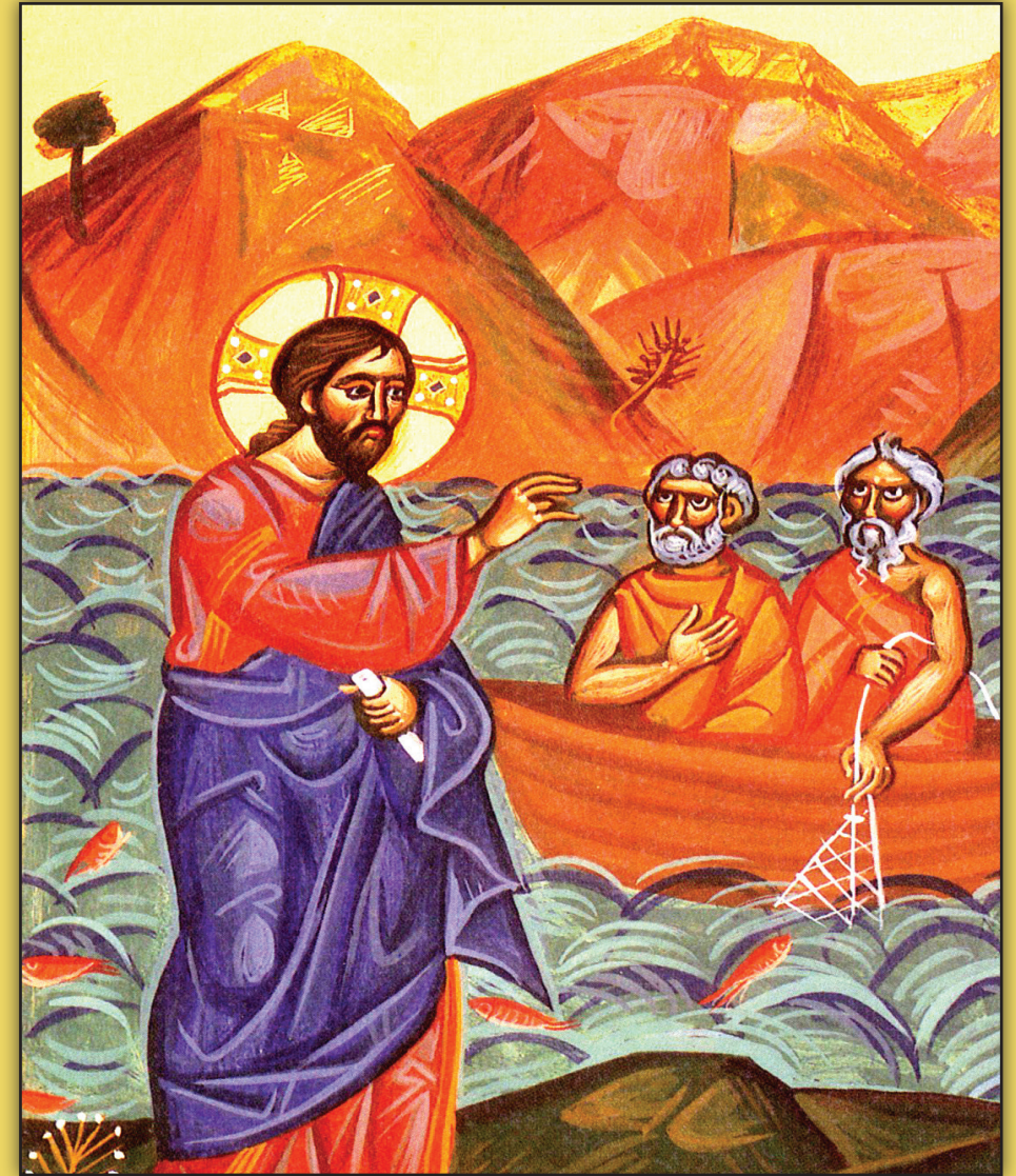
Icon of the Calling of Peter and Andrew

For books on Eastern Christianity, visit www.ecpubs.com To view over 300 videos, visit www.oltv.tv