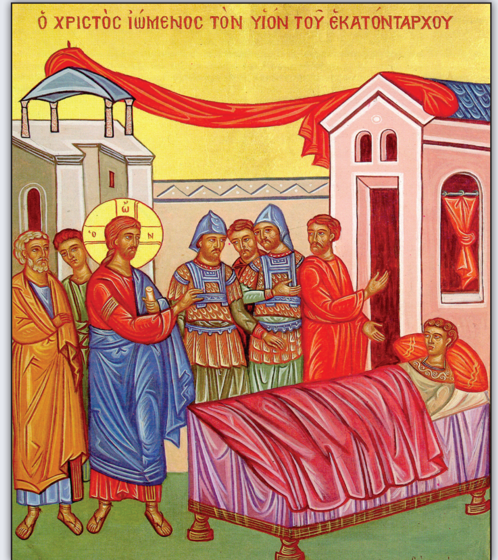
Icon of Christ Healing the Centurion's Servant

For books on Eastern Christianity, visit www.ecpubs.com To view over 300 videos, visit www.oltv.tv