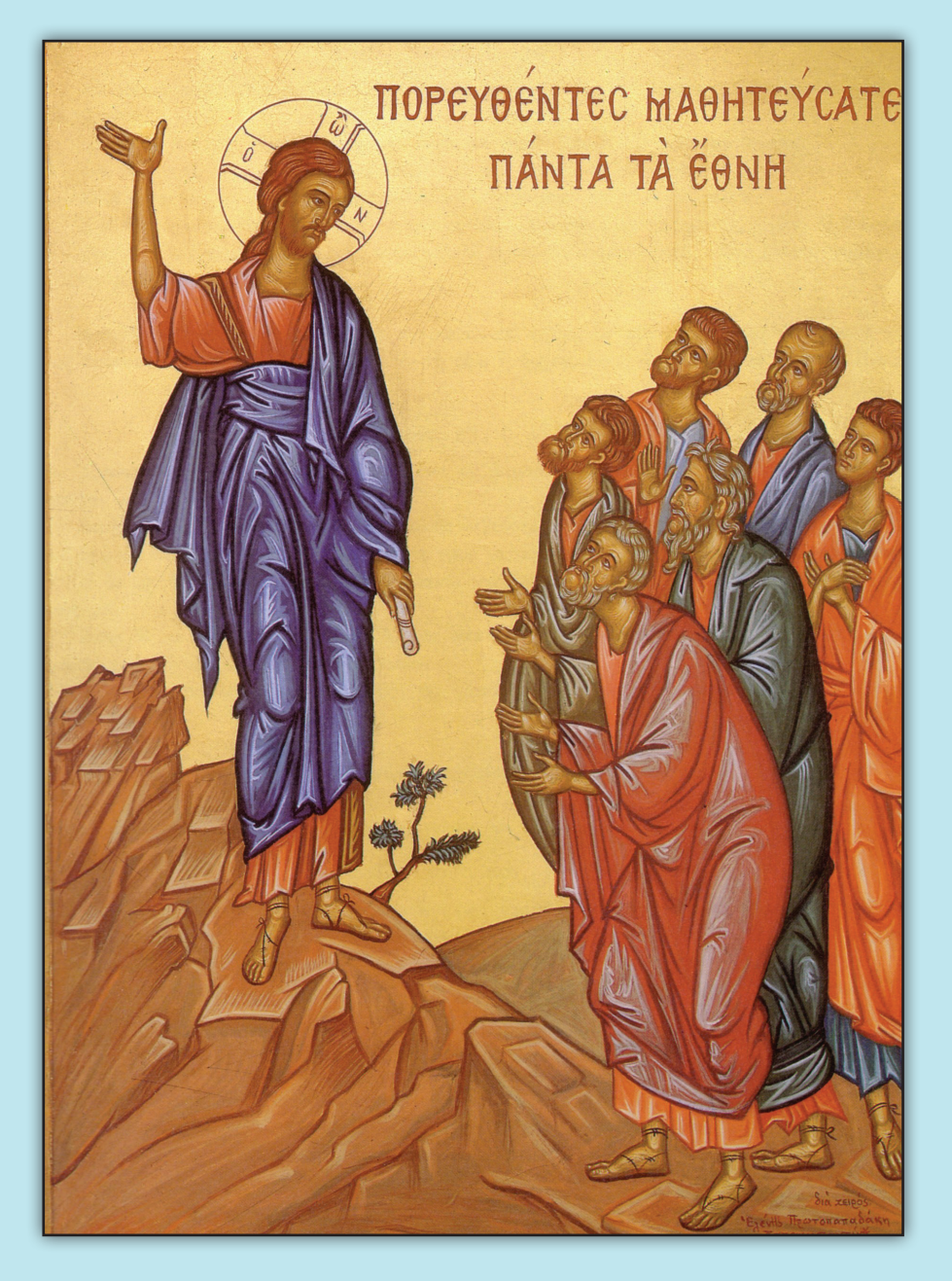
Icon of Jesus preaching to His Disciples