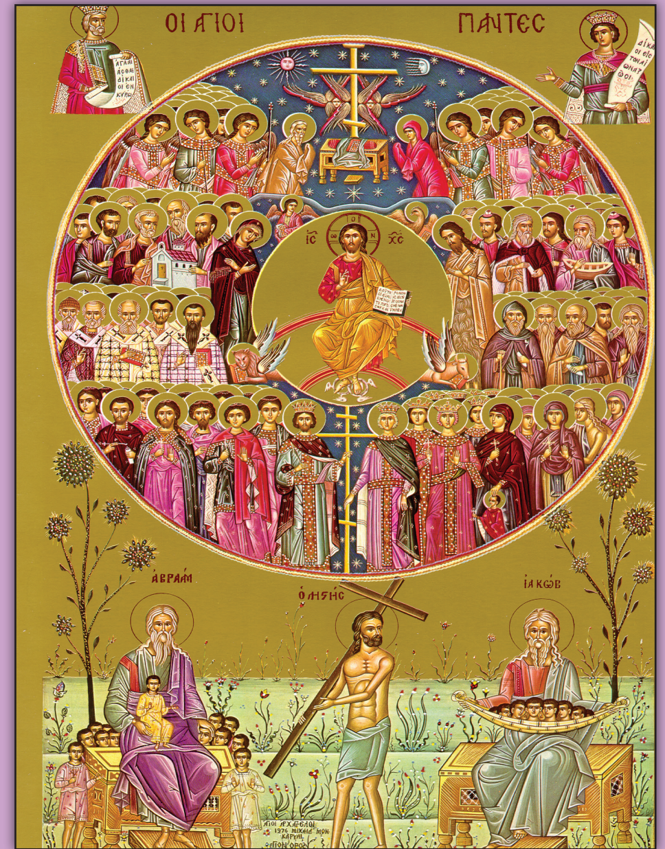
Icon of All Saints