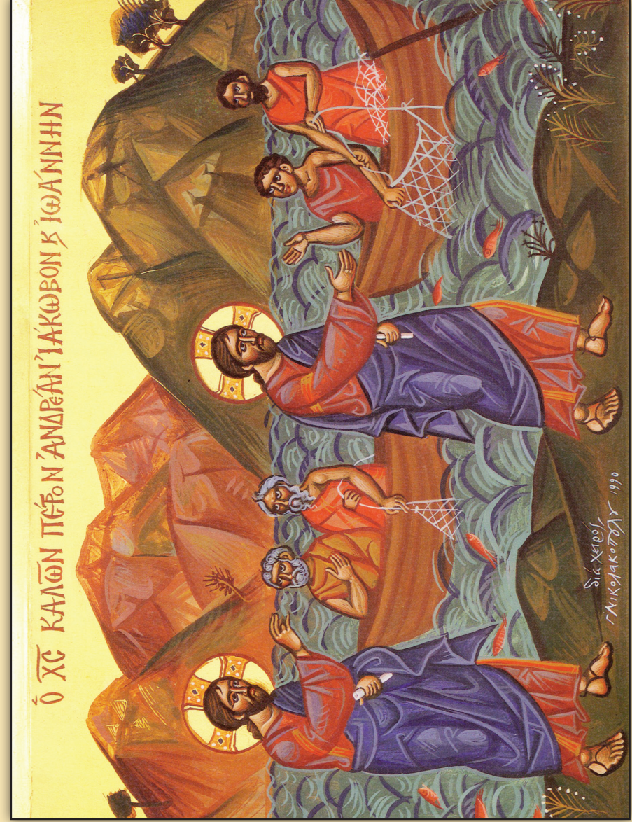
Icon of the Call of the Apostles