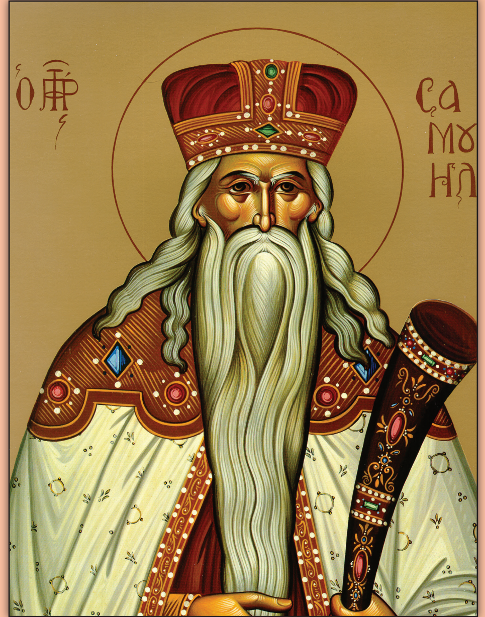
Icon of the Prophet Samuel -- August 20th