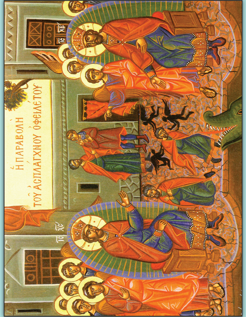
Icon of the Unforgiving Servant (Matthew 18:23-35)