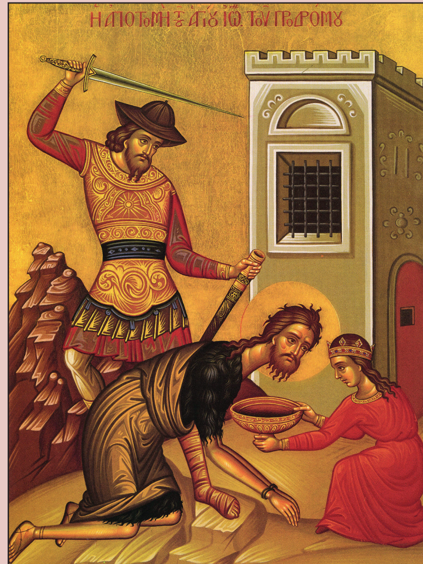
Icon of the Beheading of Saint John the Baptist -- August 29th