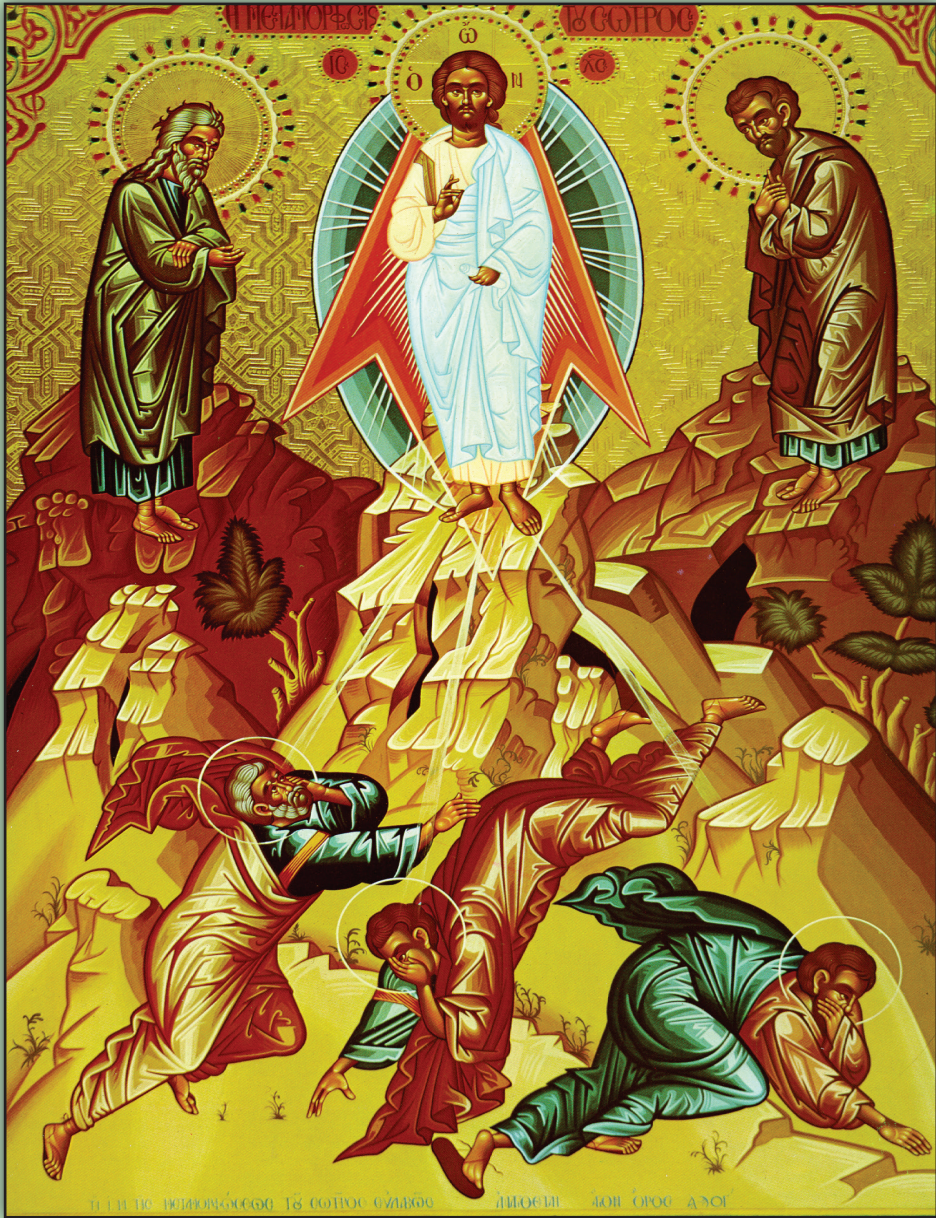
Icon of the Transfiguration of Our Lord -- August 6th