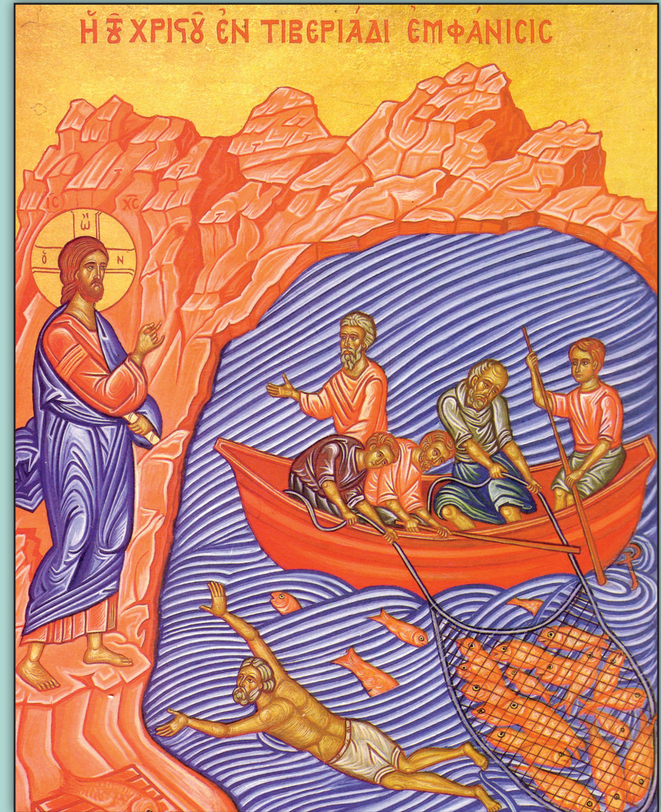
Icon of the Catch of Fish