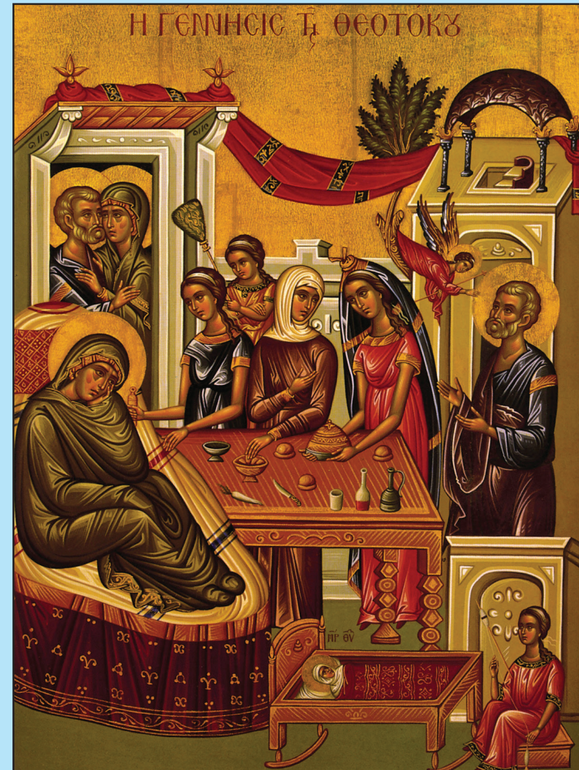
Icon of the Nativity of the Mother of God -- September 8th